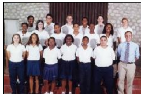
Isaac's Homeroom Students