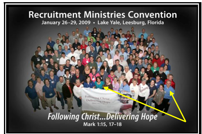
Wycliffe’s Recruitment Ministries Team

Please pray for our safety, good health and for additional financial support we will need to take this trip. Our financial needs include costs associated with medical shots, better luggage and appropriate work apparel (good hiking shoes, rain gear, dress for the climate and culture). If you would like to help us with any of these special needs, give us a call or drop us an email. Our contact information is on the back side of this newsletter.