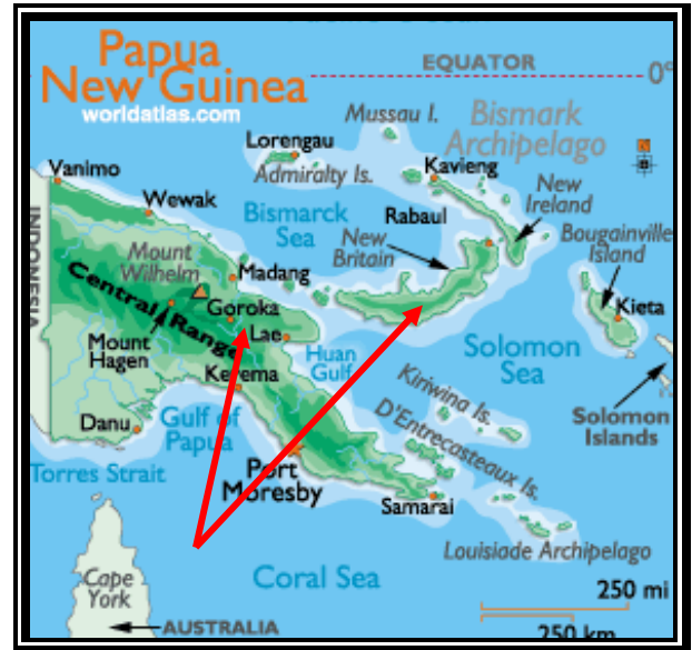
PNG Trip - June 19 – July 11, 2009

As part of our efforts to recruit new workers, we will be leading a three week trip of nine young people to Papua New Guinea (PNG) in June. This will be our first visit back to PNG in nine years.