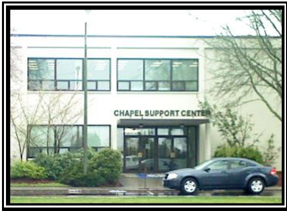
Chuck's Meetings at McChord Air Force Base, Lakewood, WA