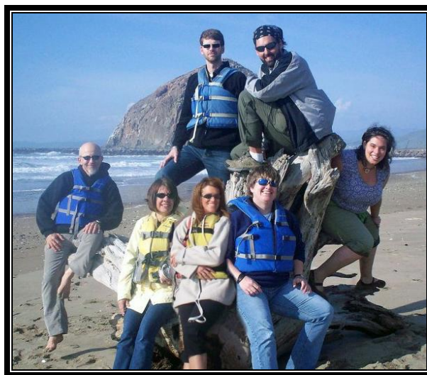
Our Next Gen Youth Ministries Team