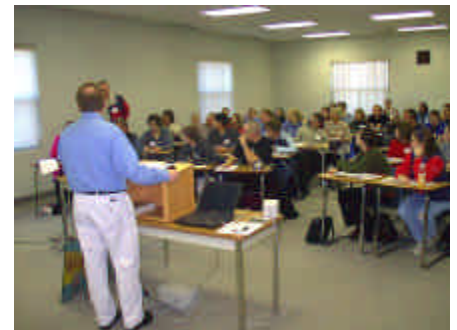
Michigan Trans Scan - Feb 23, 2002 Held At The Reformed Bible College 47 Students Attend