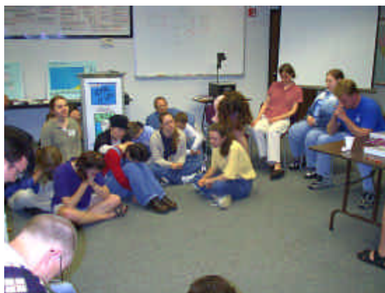
TIU Prayer Time

missionary videos, have devotions and prayer times and just hang out with the participants.