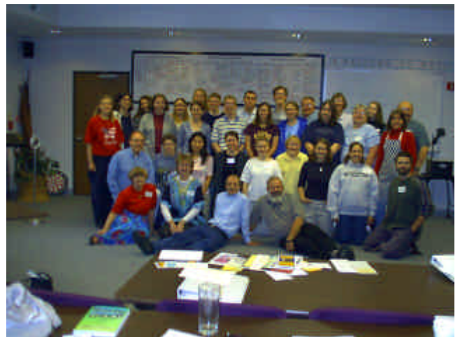
TIU May 2002