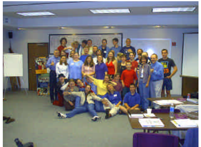
TIU August 2001