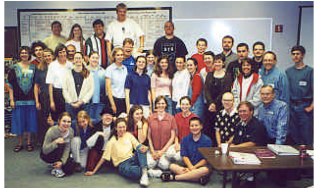
TIU May 2001