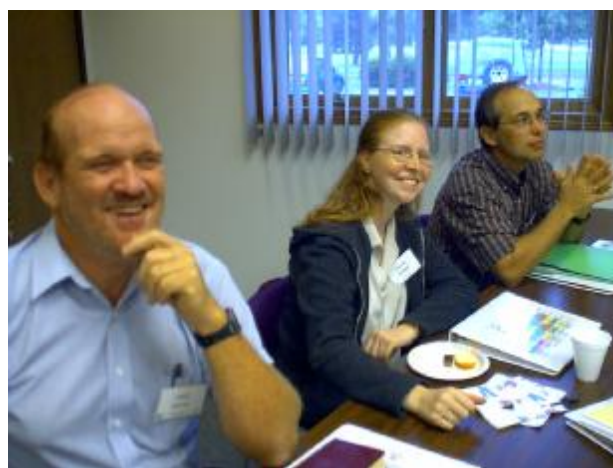
Some of the TIU Teaching Staff