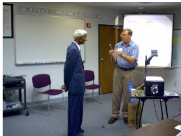
Learning the Language and Grammar of the Hindi Language in TIU

For good Bible translation it is imperative that we know all about how the patterns of the language work together. GRAMMAR is concerned with the study of these patterns of words and sentences and their use in specific languages.